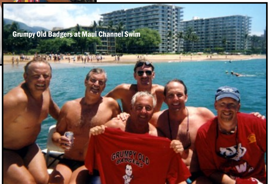
Grumpy Old Badgers at Maui Channel Swim